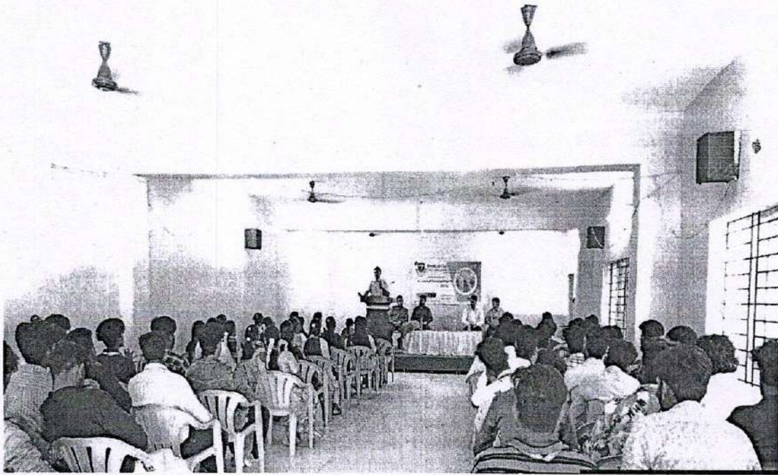
THIS SEMINAR WAS CONDUCTED FOR TALLY WORKSHOP-25/9/2018

Affiliated to Thiruvalluvar University, Vellore.