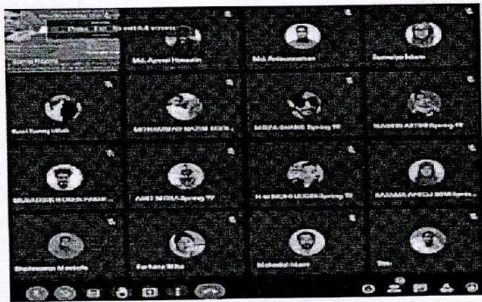
WEBINAR CONDUCTED FOR POWERPOINT WORKSHOP-05/08/2021

Affiliated to Thiruvalluvar University, Vellore. Recognized under section 2(f)(12) of the UGC Act, 1956.