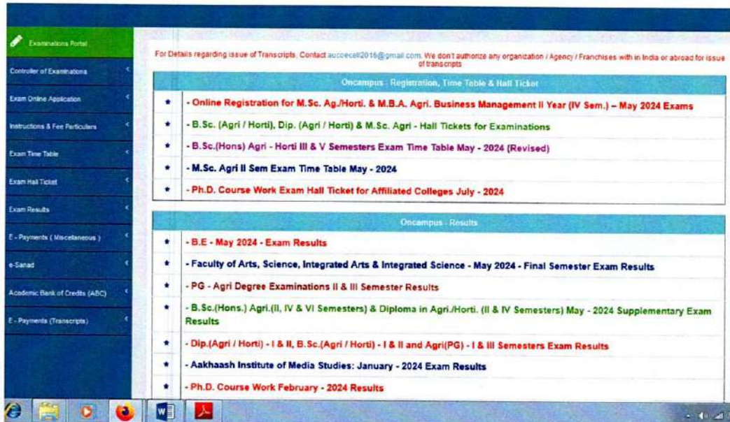
Exam: Selection of Examination wing