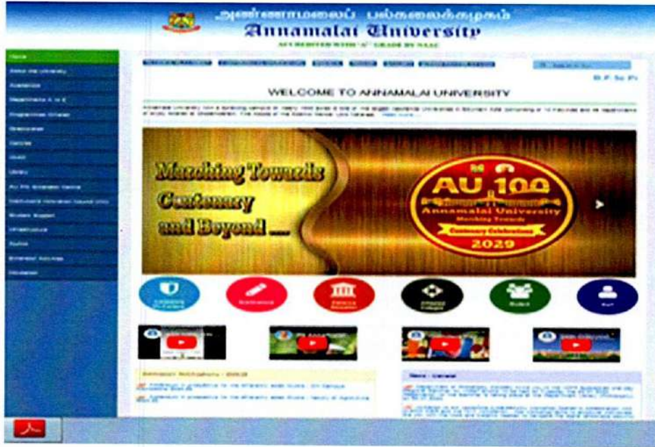
Exam: AU web portal home page